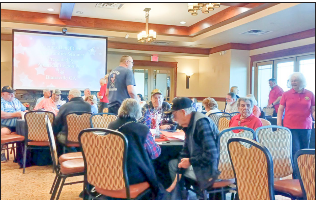
American Legion Post 121 welcomed a full house for its free Veterans Benefits & Opportunities Seminar on March 14.